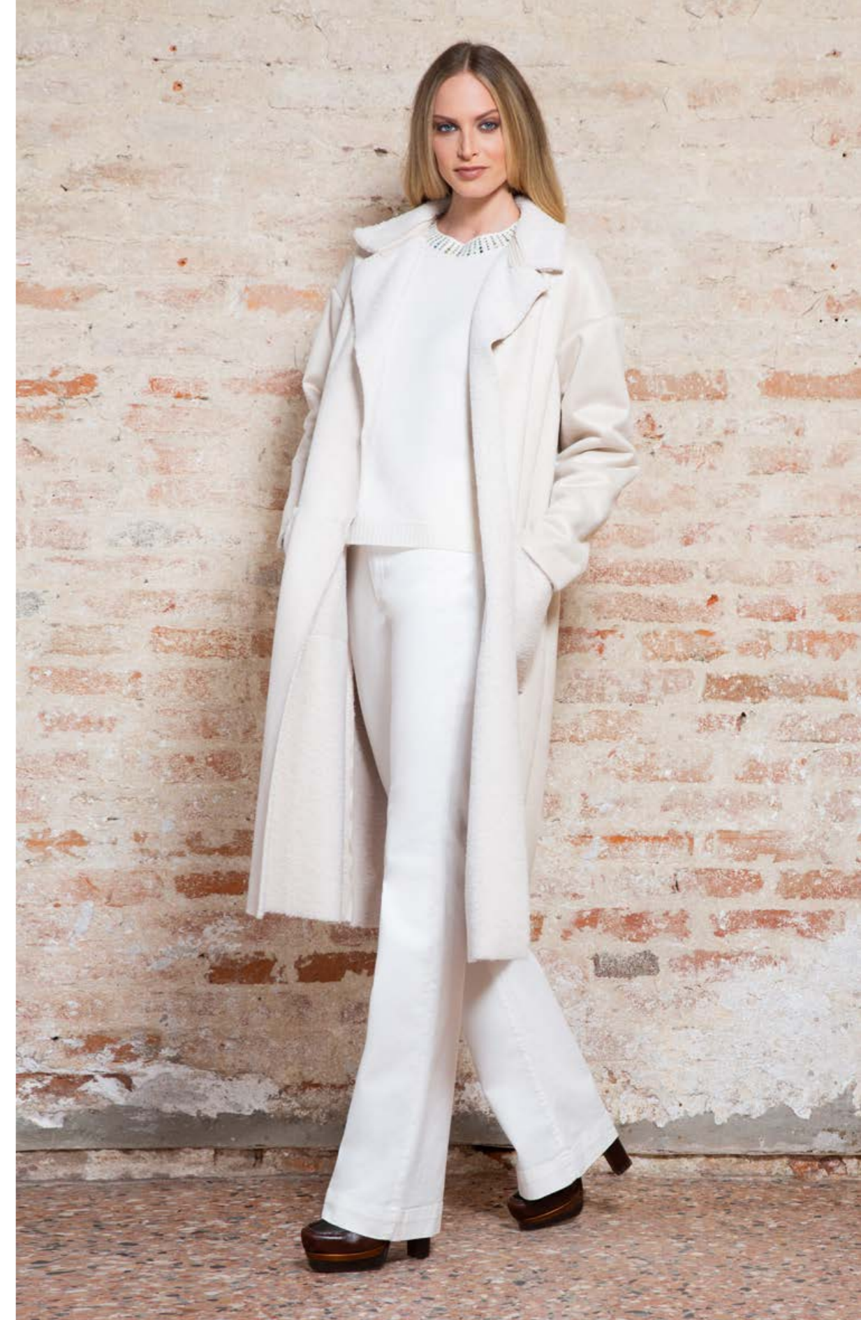
Coat BETH 8183 13013 Sweater ELLEN-CO 3319 130 Trousers FANTA-SL 130