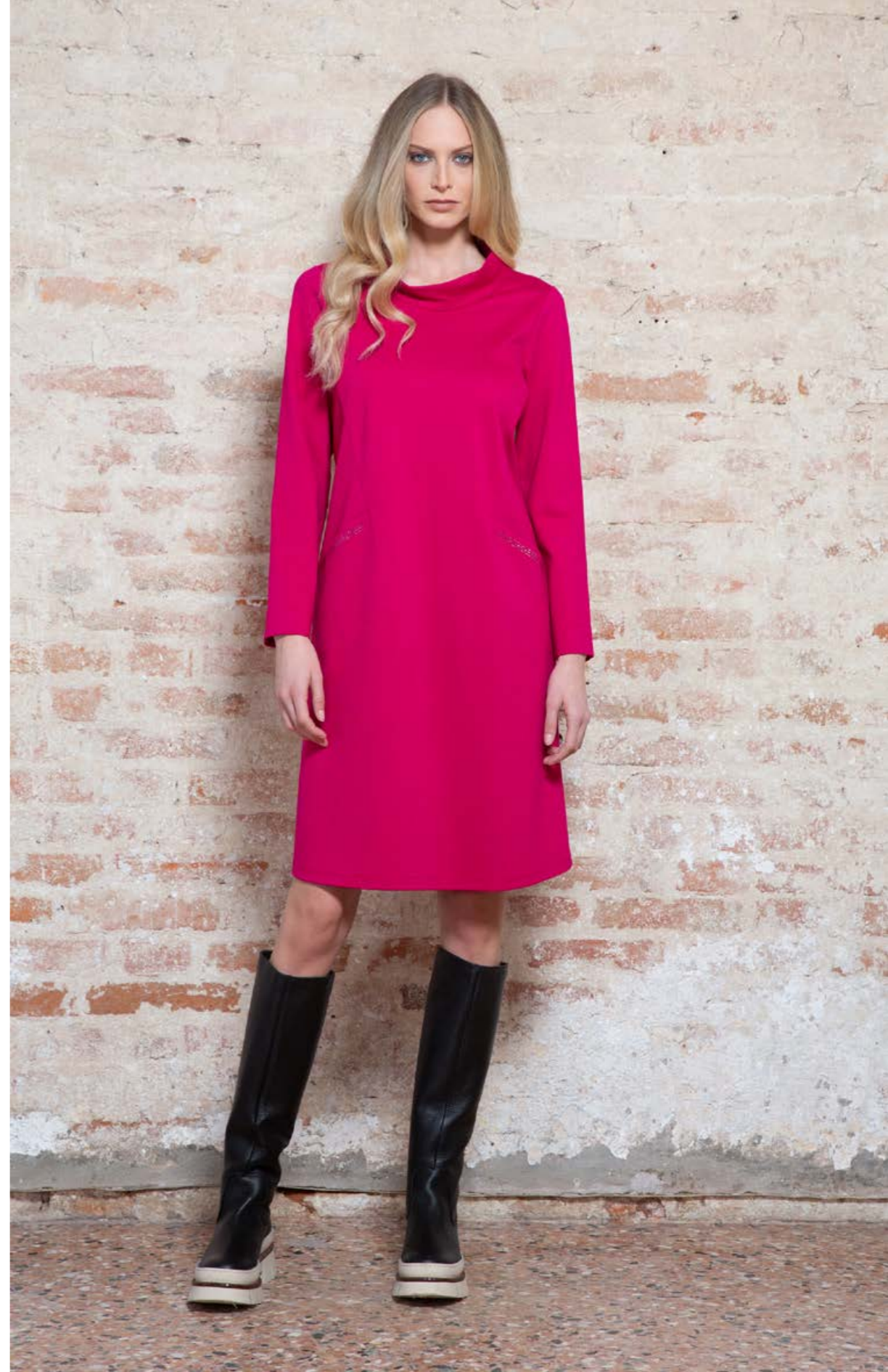
Dress REX-FI 4723 687