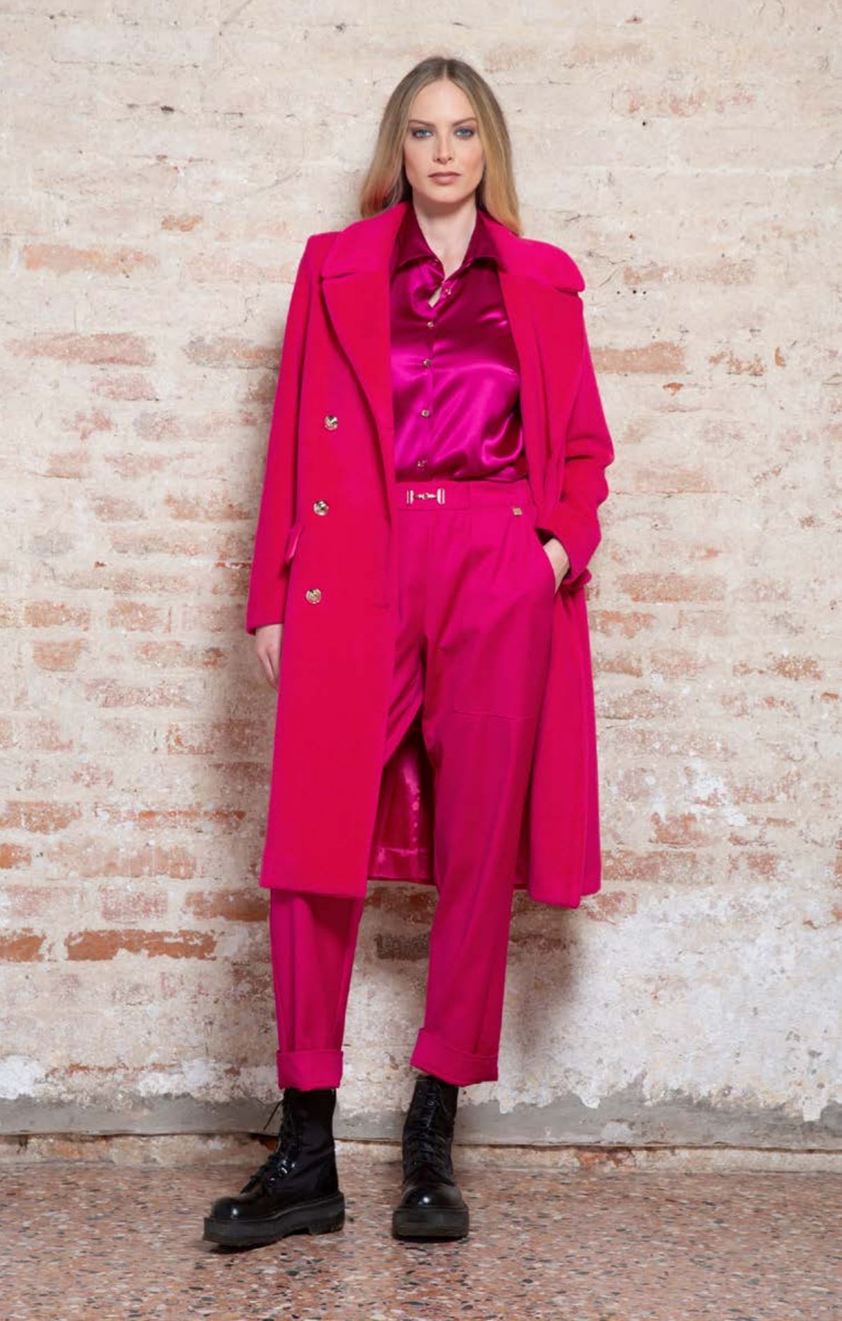
Coat BERNICE 5254 687 Shirt SILIA 4782 687 Trousers FLICK 4756 687