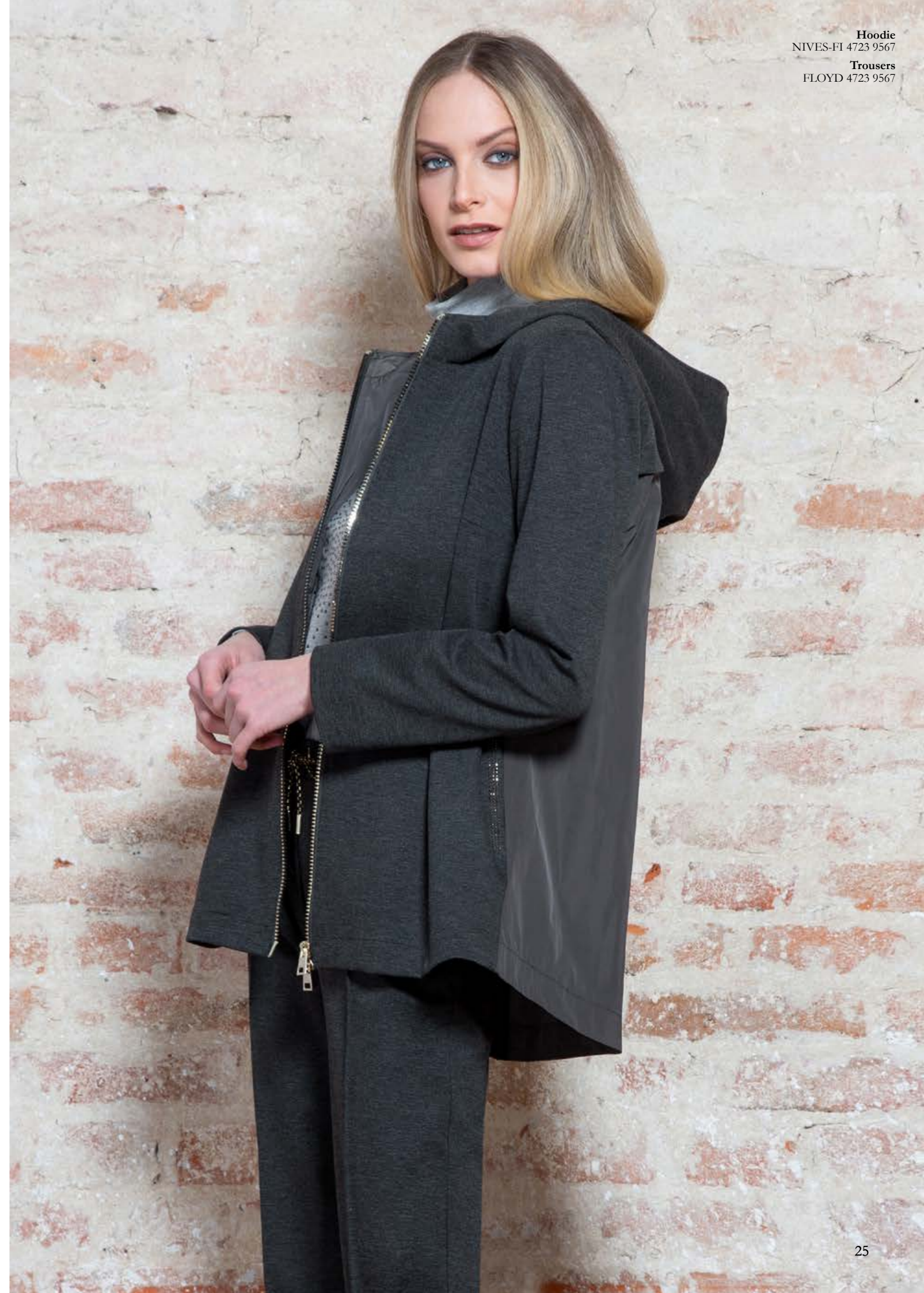
Hoodie NIVES-FI 4723 9567 Trousers FLOYD 4723 9567