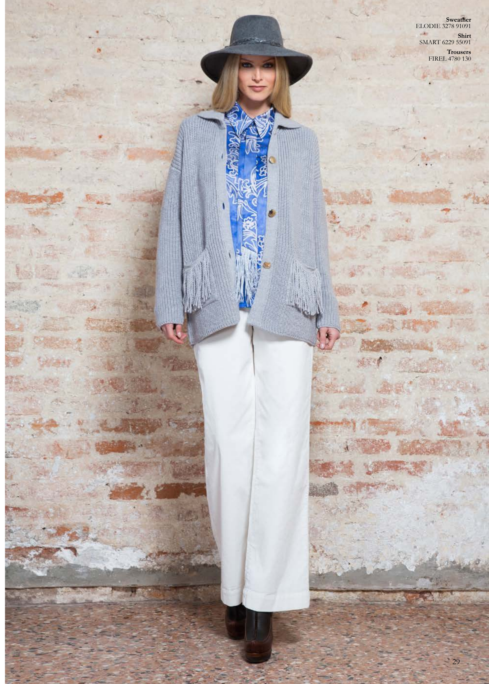
Sweater ELODIE 3278 91091 Shirt SMART 6229 55091 Trousers FIREL 4780 130