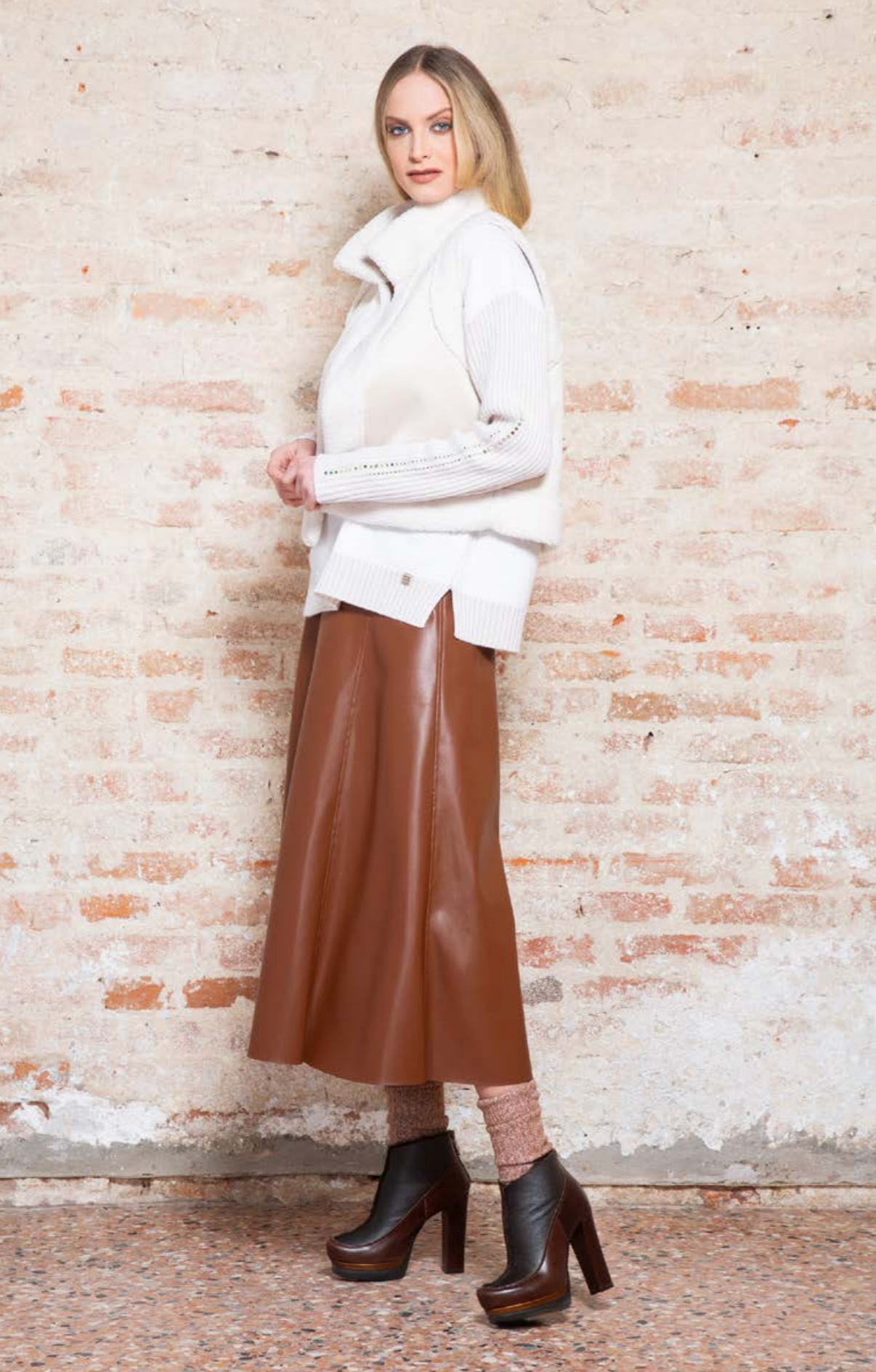
Gilet BIANCA 8183 13013 Sweater DARBY-PO 3211V 13021 Skirt WADE 8172 255