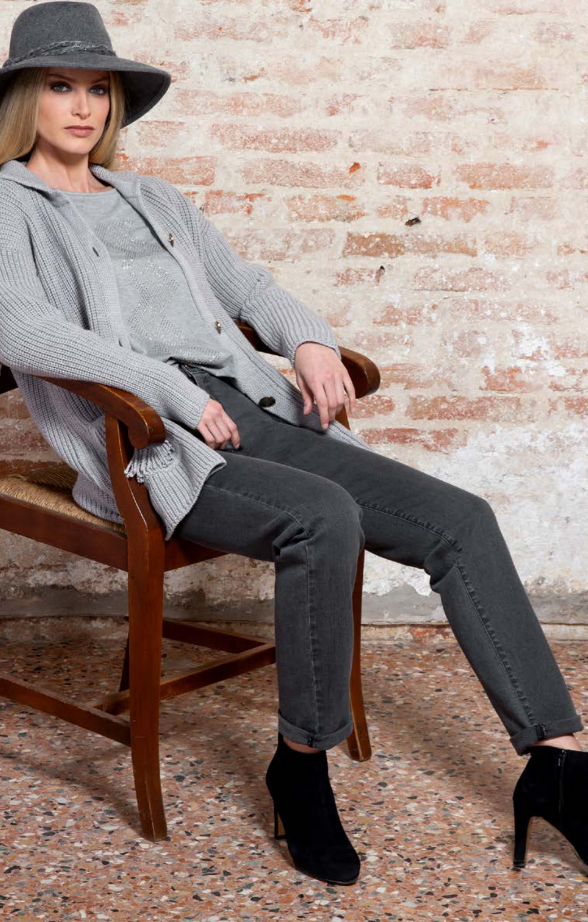
Sweater ELODIE 3278 91091 T-shirt MIRTA-INC 2363B 91091 Trousers FEVER-ZP 4786 59959