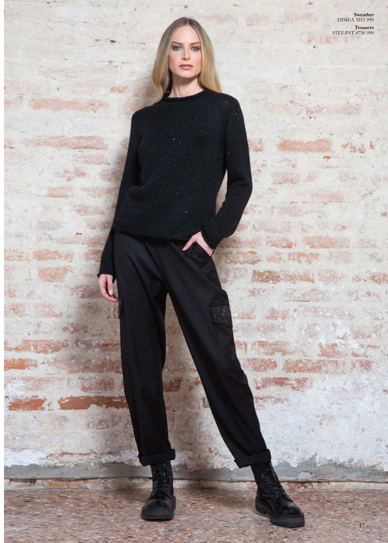
Sweater DIMEA 3211 990 Trousers FITZ-PAT 4756 990