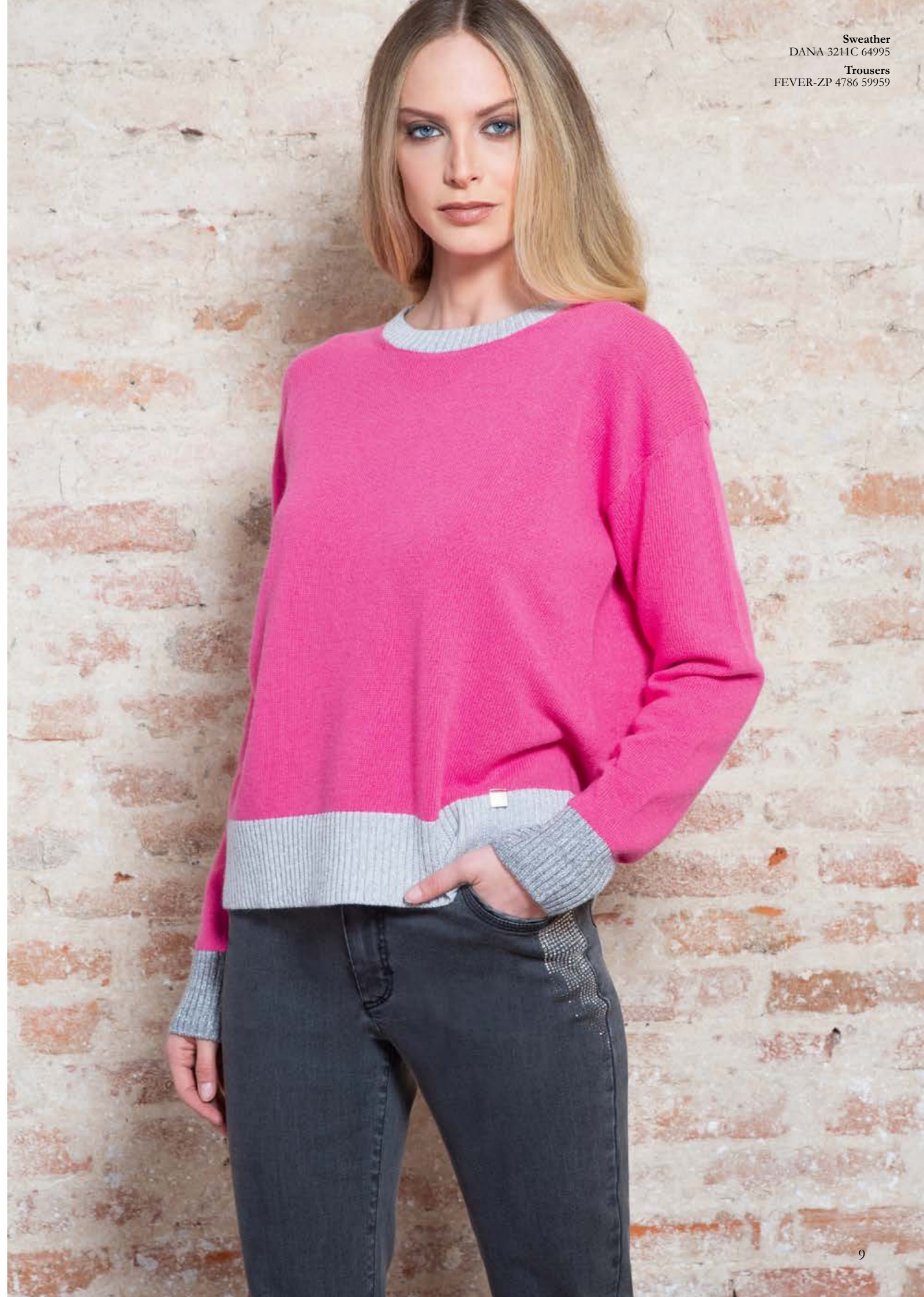
Sweater DANA 3211C 64995 Trousers FEVER-ZP 4786 59959