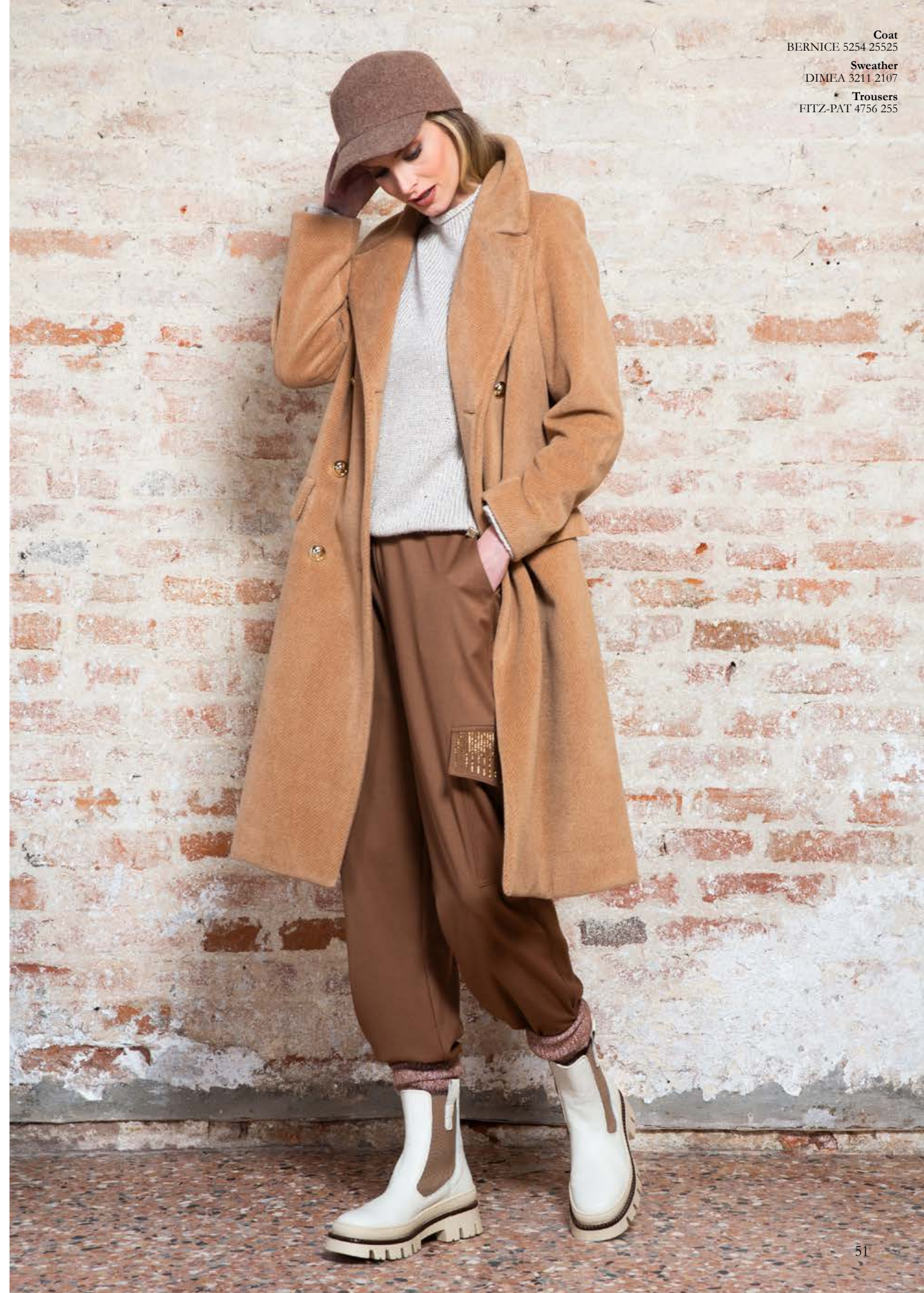
Coat BERNICE 5254 25525 Sweater DIMEA 3211 2107 Trousers FITZ-PAT 4756 255