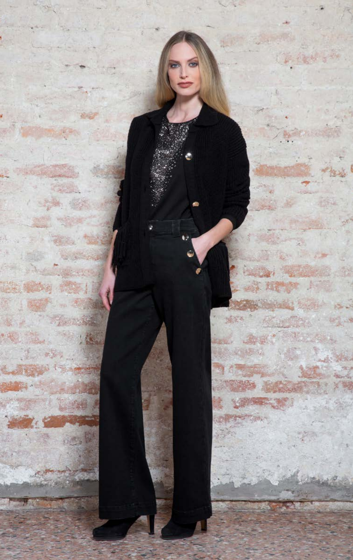
Sweater ELODIE 3278 990 T-shirt MIRTA-V 2363 990 Trousers FICTIONY 4786 599