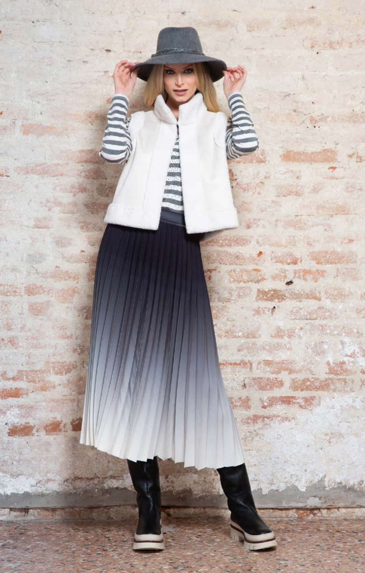
Gilet BIANCA 8183 13013 T-shirt MIRTA-ESP 7239 95613 Skirt WOLA 2354 95613