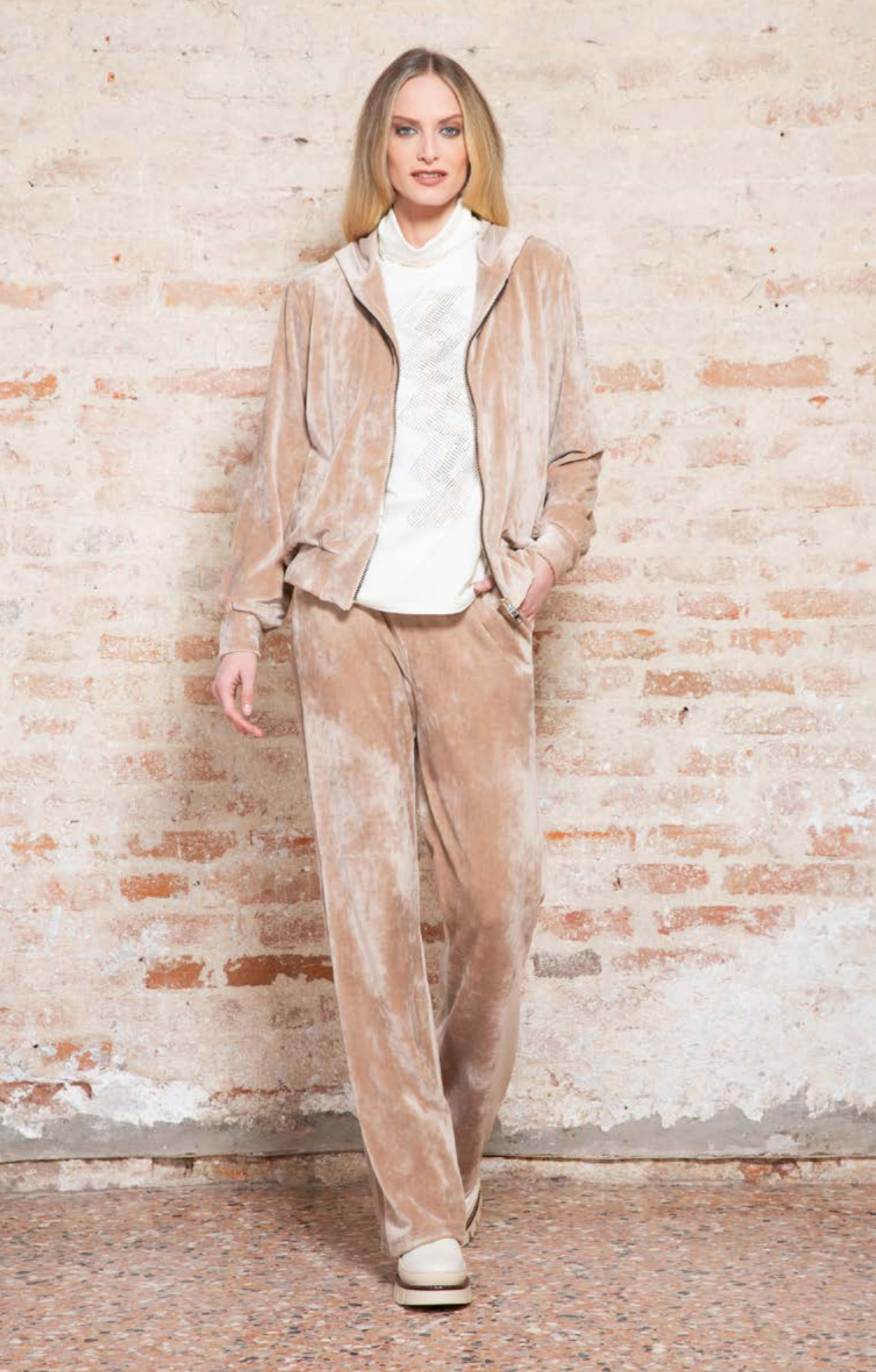
Hoodie NICOLE-STE 2364 212 T-shirt MINA-INC 2363B 13021 Trousers FIDO 2364 212