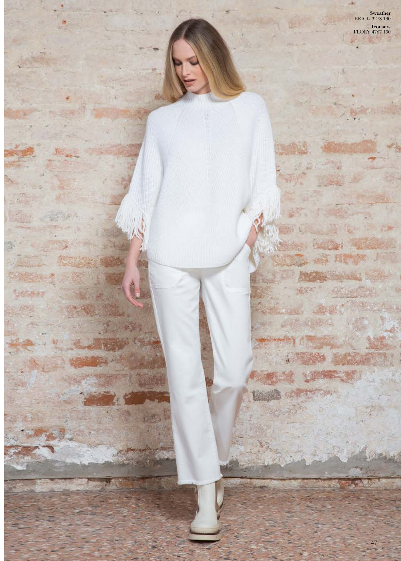
Sweater ERICK 3278 130 Trousers FLORY 4767 130