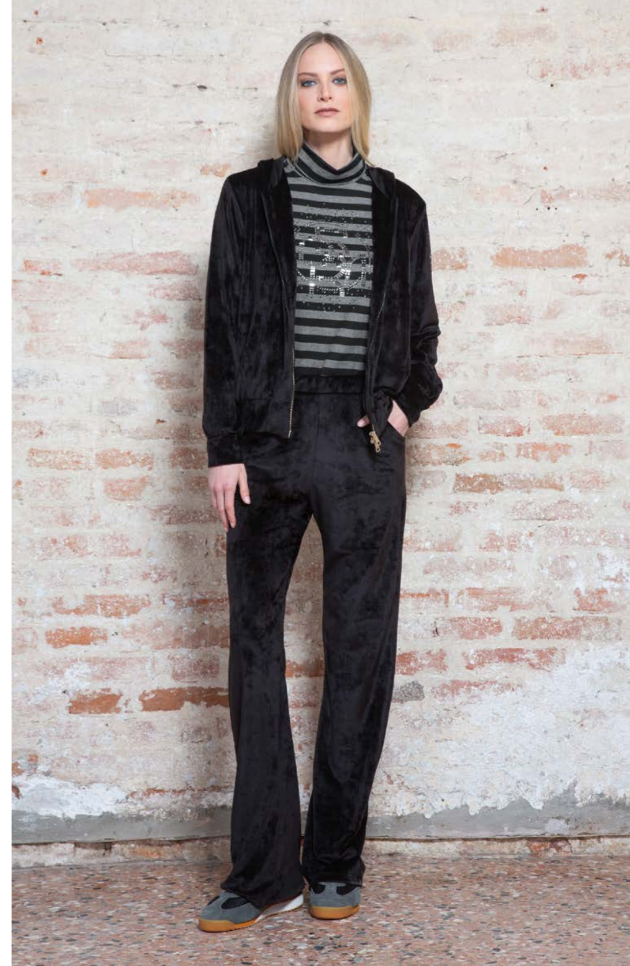
Hoodie NICOLE-STE 2364 990